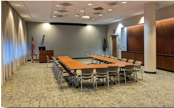
Meeting Space — Annual Meeting Sessions will be held in the Jones Room of Emory’s Woodruff Library

South, 103 Decatur Street SE, Atlanta, GA 30303. Phone number: 404-413-2880