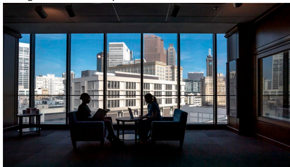
Window on Atlanta — The view from Special Collections at Georgia State University