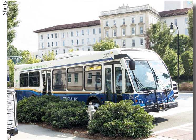
Come on and take a free ride! — The CCTMA Shuttle will provide free transportation between the hotel and Emory on Friday.

Square back to the hotel, or stay on the shuttle for one more stop (though the shuttle may wait a few minutes at the station before heading back to Emory). The shuttle will stop at Clifton and Fishburne on the way back to Decatur at approximately 5:10pm, 5:40pm, or 6:15pm on Friday. 🚏