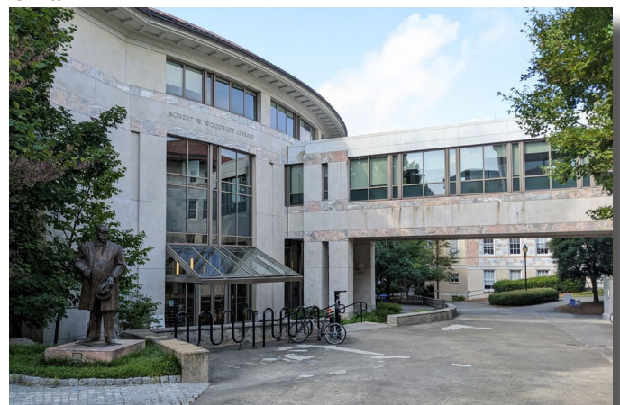
Entrance to Emory's Robert W. Woodruff Library