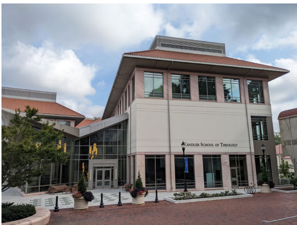
Candler School of Theology — Home of the Pitts Theology Library