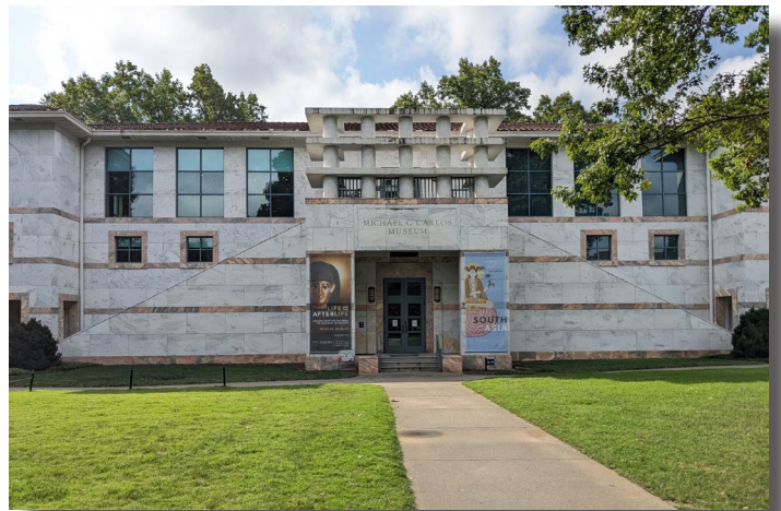
Michael C. Carlos Museum