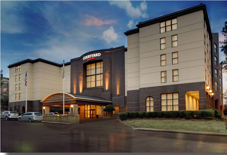
Conference hotel — The Courtyard by Marriott - Atlanta Decatur Downtown/Emory

The hotel is 2.5 miles from Emory’s Woodruff Library, where the conference meetings and Thursday night reception will take place; there is a free Emory shuttle on weekdays that goes to the library and back to the hotel about every 25 minutes (details below). For those driving, parking at the hotel is $10/day with in-and-out privileges; just park at the Courtyard by Marriott parking deck, take the ticket and bring it to the check-in desk. After checking in, you will be able to enter and exit the deck with your room key. If you are rooming with someone and will need separate receipts, please be sure to let them know, as they are willing to create separate bills with your name on them (though both credit cards will appear on the receipt).