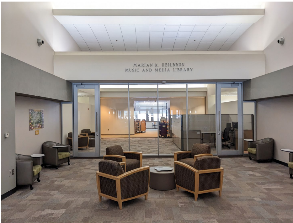
Emory's Marian K. Heilbrun Music and Media Library