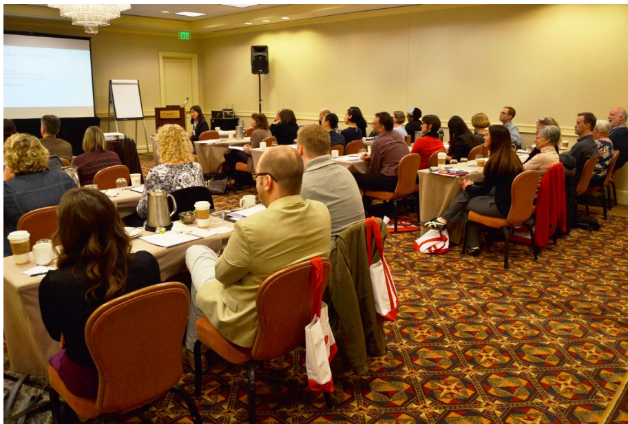
In the Navigators’ Seats — Preconference attendees.

positively to, say, continue on a project we care deeply about).