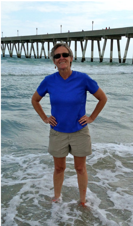
Dreaming of warmer days — like this one in September 2013 at Wrightsville Beach, NC

You two were awesome, truly, and I can't thank you enough for all the effort and commitment you put into ensuring the success of the meeting. I think SEMLA put on a darn good show, and I know that many MLAers expressed appreciation for the various SEMLA contributions.