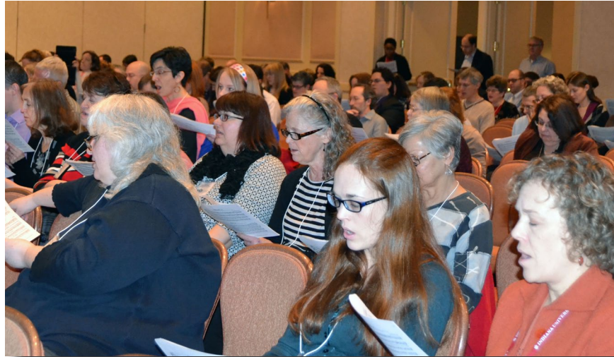
to MLA— Shape-Note Singing at the Opening Plenary Session