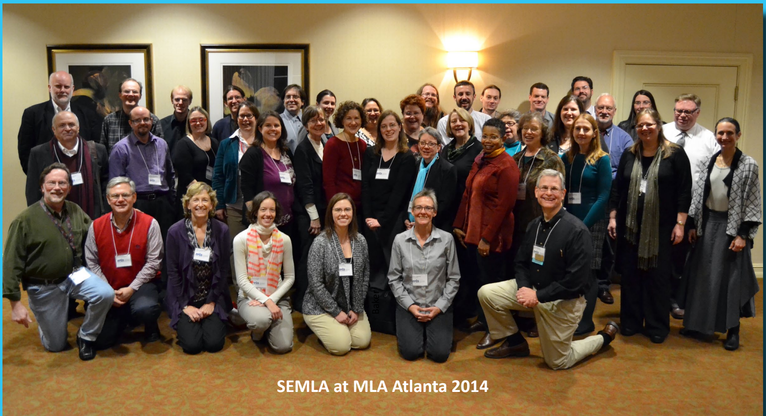
SEMLA at MLA Atlanta 2014

Please note that according to the SEMLA bylaws, dues are to be paid by July 1st of each year. Any members that haven't paid by July 1st are considered in arrears. If a member remains in arrears for a period of one year, that person is removed from the membership database. You can review this information at http://semla.musiclibraryassoc.org/bylaws.html (Article III: Membership).