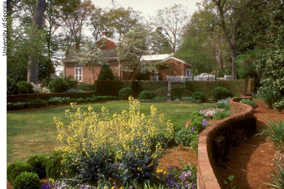
Things to see — Founders Garden, UGA North Campus

We look forward to seeing you in Athens this fall for what is shaping up to be yet another SEMLA classic.