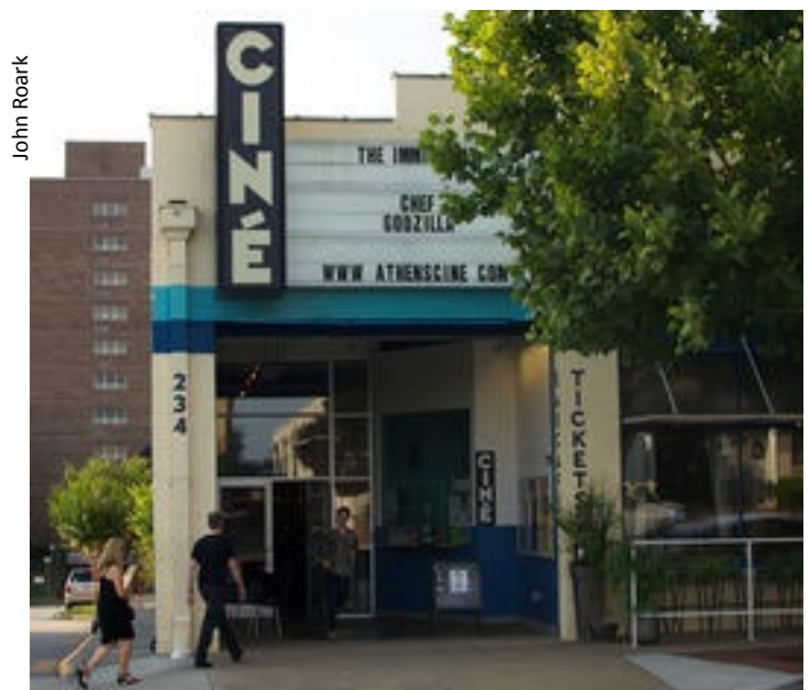
Banquet venue—Another view of Ciné

Of particular interest to many: all of the sides will be vegan, and can be combined to form a nicely portioned vegetarian/vegan entrée. Even one of the dessert options is vegan. But carnivores, despair not! A featured entrée will be slow-braised Anderson Farms (see http://andersonfarmsgeorgia.com/ ) pork shoulder with roasted & raw apples and a sorghum