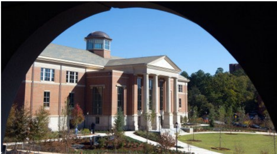
Conference site — Richard B. Russell Building Special Collections Libraries, site of our meeting sessions and opening reception