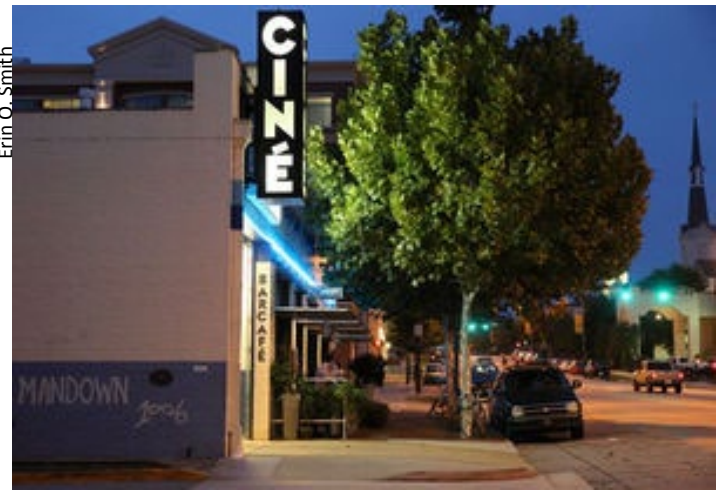
Banquet venue—Athens Ciné, site of our banquet on Friday evening

transportation is currently planned. Please let us know during registration if you have mobility issues, so that we can make the necessary arrangements. We will get everyone to the banquet!