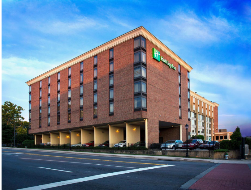
The “Right” Hotel—Holiday Inn Athens-University Area, looking southeast across E. Broad Street

To call the hotel’s front desk directly: 706-549-4433 .