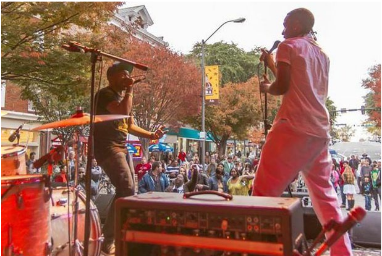
Live music in Athens —BLACKNERD(ninjas) performed at AthFest in downtown Athens this past June

Music: http://flagpole.com/music Flagpole Magazine, also available free around town in hard copy in most coffee shops and other locations, is the unofficial hipsters' guide to all things Athens. Many of us who may lay no claim to being hipsters are often spied reading it covertly, behind a copy of the Wall Street Journal or the NY Times.