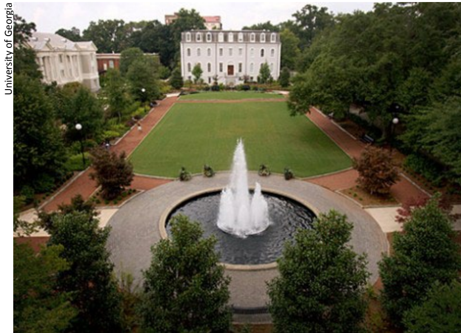
Things to see—Herty Field, UGA North Campus