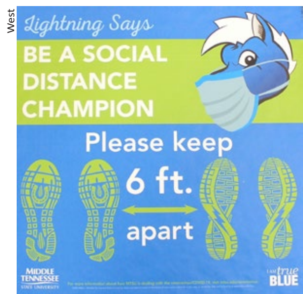
"Sign, sign, everywhere a sign" — Social distancing signage displayed throughout the campus of Middle Tennessee State University

Peace, my friends. I look forward to seeing you soon.