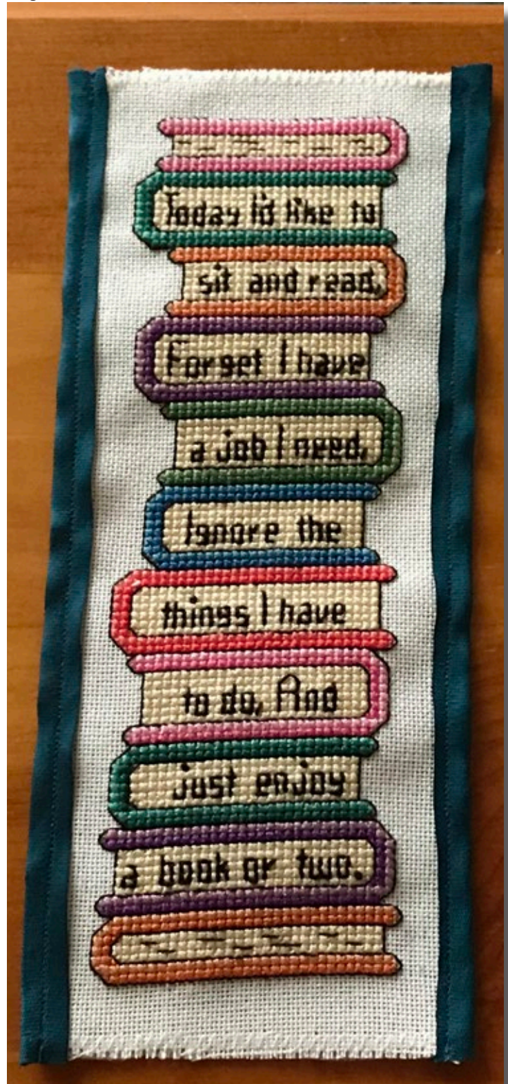
Sign of the times — Shelley Rogers cross-stitched this bookmark recently.