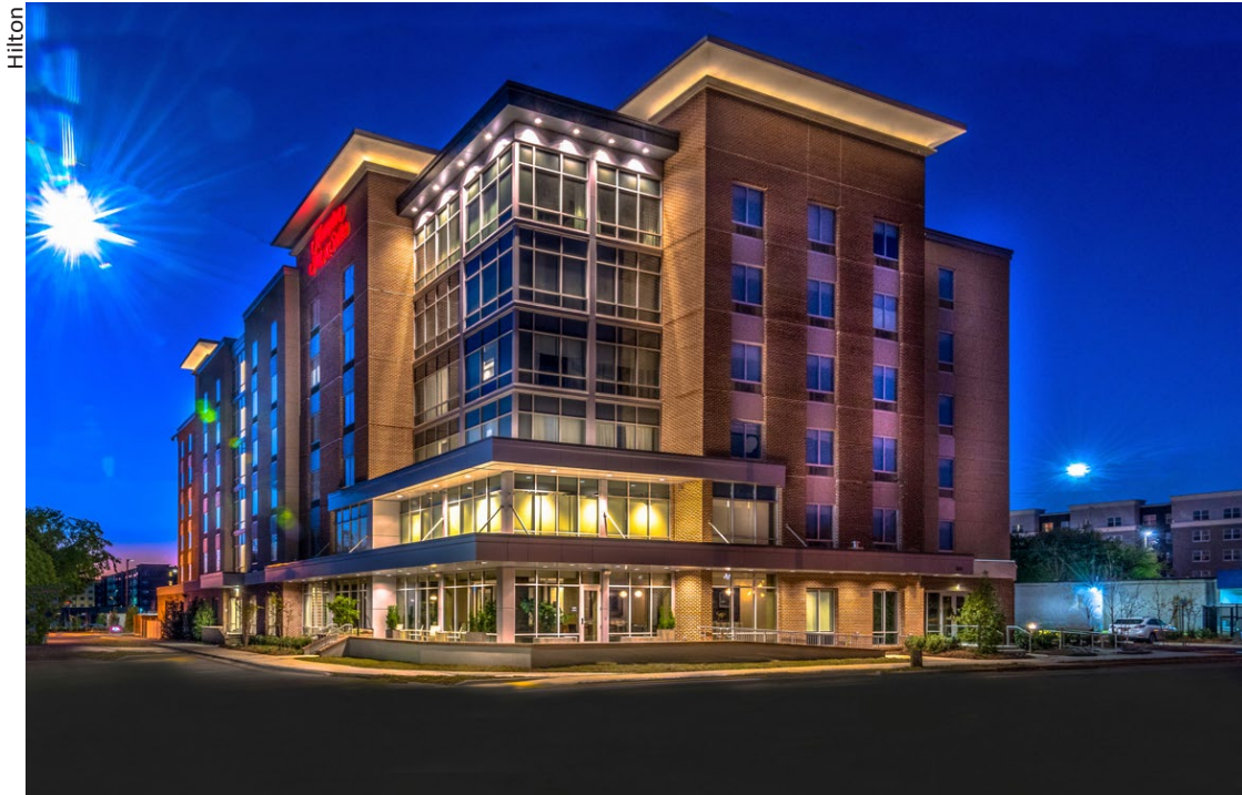
Conference hotel — The Hampton Inn & Suites Tallahassee Capitol-University.