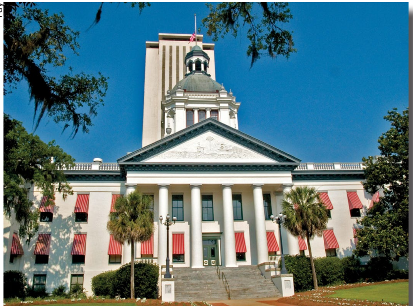
The Florida Historic Capitol Museum in Tallahassee.

Located only a short (uphill) walk from campus and the music complex, the Hampton Inn & Suites Tallahassee Capitol-University is in the heart of Tallahassee, between the