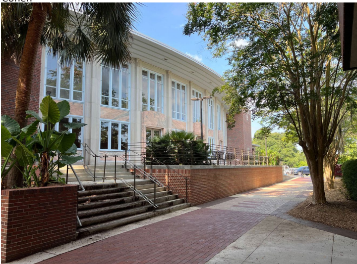
Opperman Music Hall