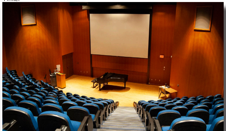
Dohnányi Recital Hall