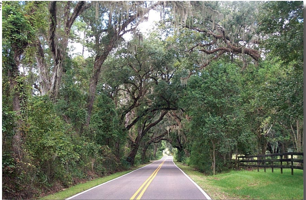
Old St. Augustine Road, one of Tallahassee's signature canopy roads.