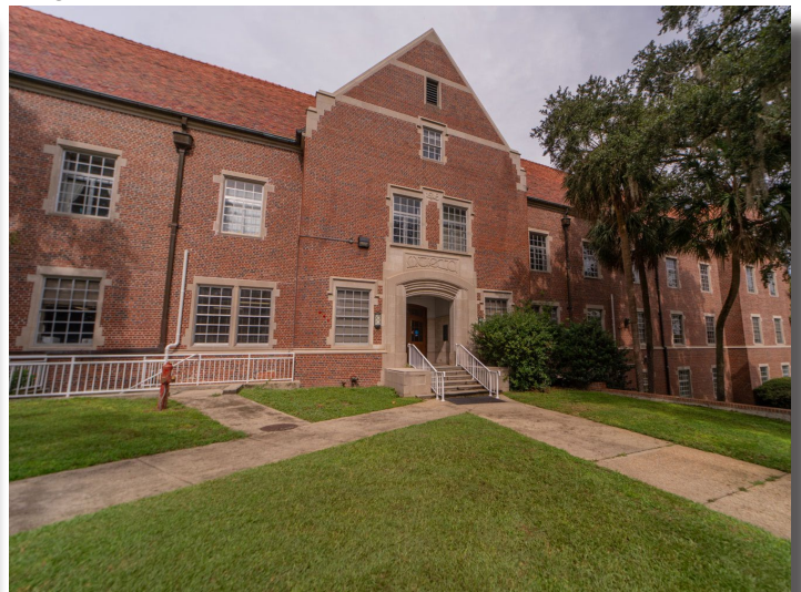
Kuersteiner Music Building