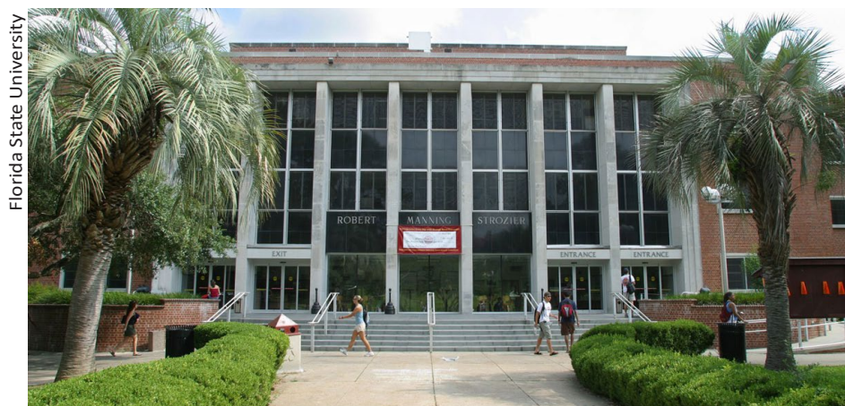
Strozier Library, Florida State University

http://semla.musiclibraryassoc.org/semla2022/preconference.html .