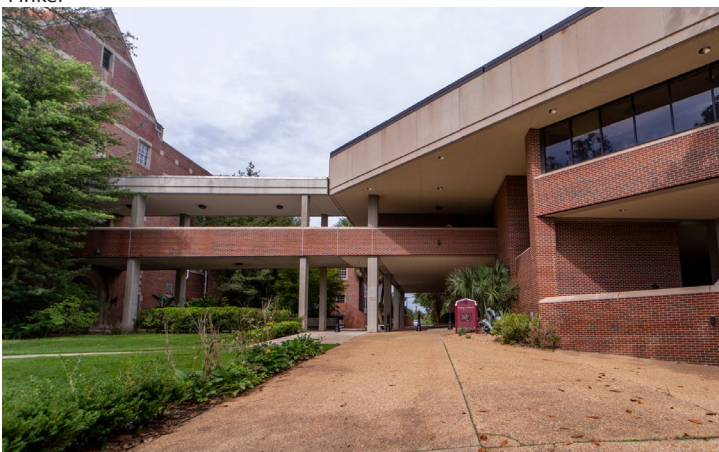
Housewright Music Building