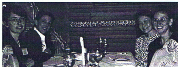
Amadeus Restaurant, 1997 SEMLA Chapter Meeting