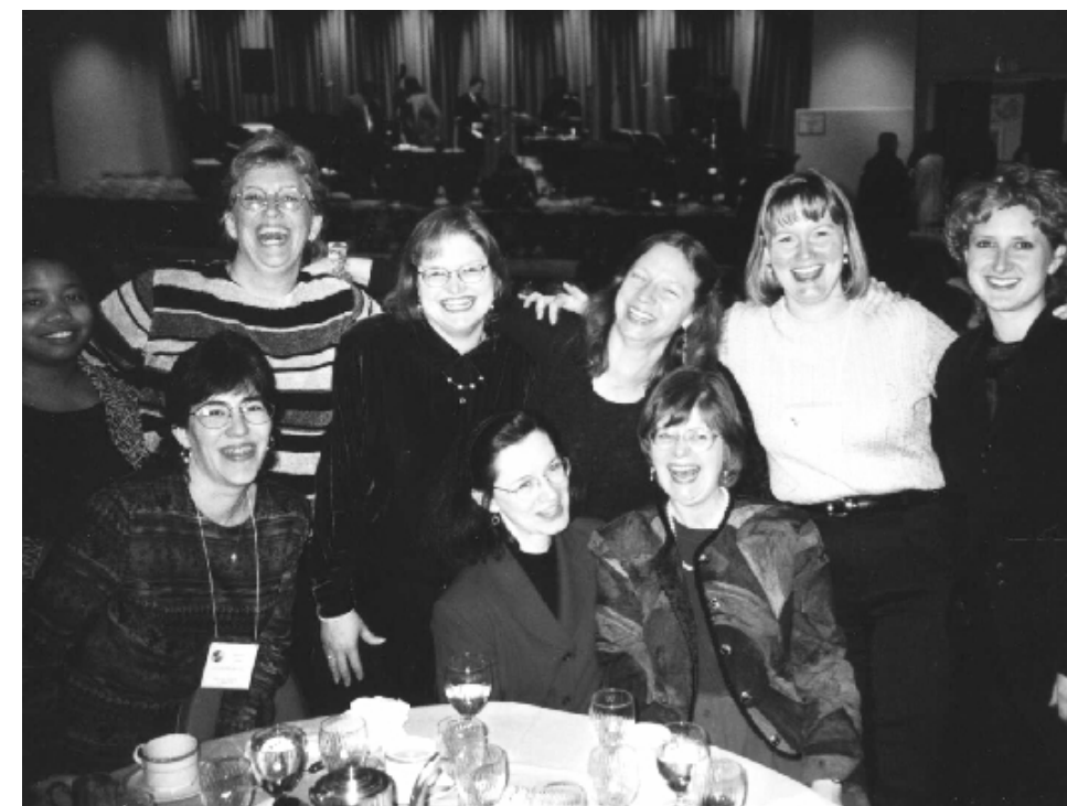
SEMLA ladies enjoying the banquet in Los Angeles.

You will receive a confirmation message from the list.