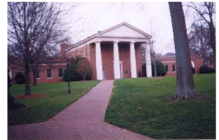
The Cunningham Fine Arts Building

Governing all student activities on campus is the Honor Code, which all students formally pledge to follow at the beginning of their Davidson career. Indications of the importance of the honor code to everyday life at Davidson are visible everywhere. For example, student exams are not proctored. Nor are there security gates in the campus libraries.