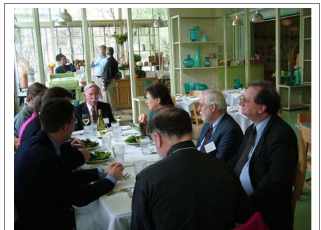
Banquet at the Watershed Restaurant