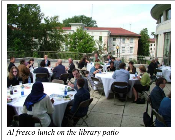
Al fresco lunch on the library patio

compromising the privacy of individuals who can now be monitored for illegal activity. Questions arise over who is responsible for illegal activity--the computer companies and liaisons like Napster who provide the technology, or the individuals who take advantage of it.