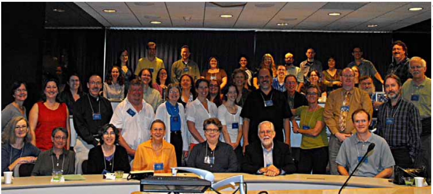
SEMLA/TMLA 2009 Loyola University New Orleans

Choir, and a traditional Māori funeral ceremony. Smiles and much talk of “doing it again” were shared as the two chapters broke apart for their respective business meetings. The minutes from the SEMLA business meeting are included in this issue of Breve Notes . ■