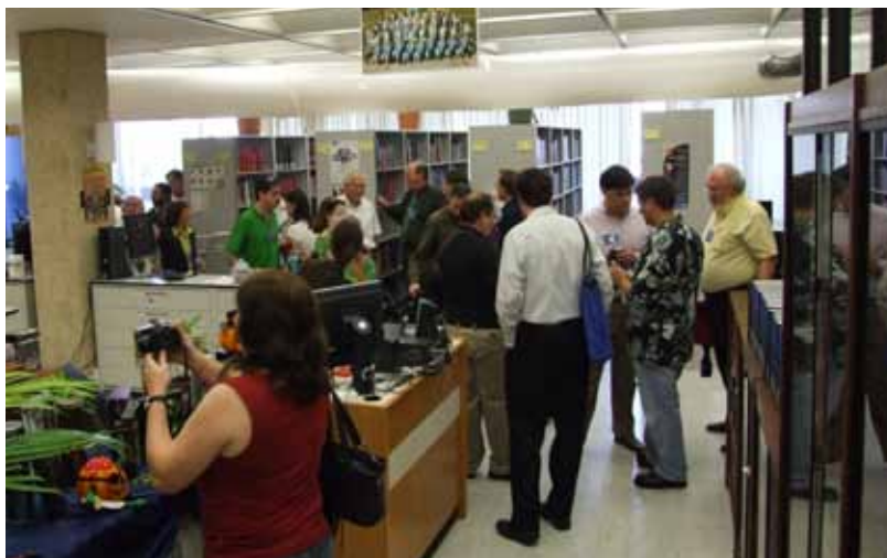
The new Music and Media Center on the 4th floor of Tulane’s Howard-Tilton Memorial Library