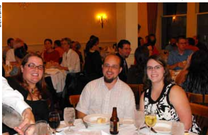
Banqueting at the Palace Café on Canal Street

Canal Street. The restaurant, housed in the Werlein building (former home of Werlein's, the nation's oldest family owned retail music chain,) is owned in part by Dickie Brennan, of the famed New Orleans restaurant family. A graceful