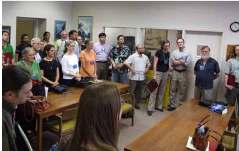
Touring the William Ransom Hogan Archive of New Orleans Jazz

While the Hogan Jazz Archive was relatively undamaged by Katrina, the Music Library at Tulane, housed prior to