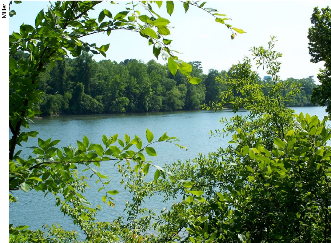
Black Warrior River

see Annual Meeting Preview — continued on page 8