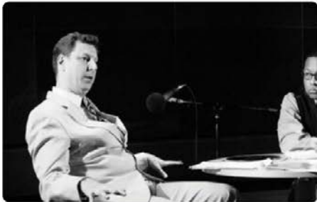
"Fiddler" Claude Williams Interview (2/13/1989)