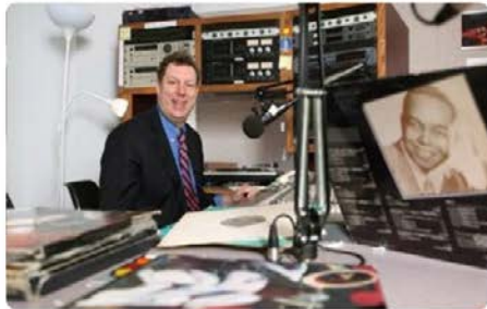
An Examination Of The Impact Of Pre-1923 Jazz Recordings Post "Crazy Blues": Part I (3/19/2016)