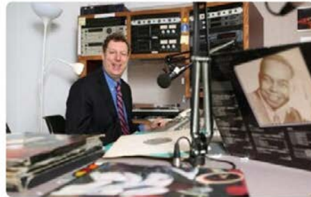
An Examination Of The Impact Of Pre-1923 Jazz Recordings Post "Crazy Blues": Part II (3/21/2016)